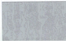
*GALV-TEN ™ RAW