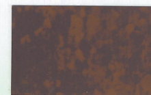
*COR-TEN AZP ® RAW

*Available at a slight price premium. Colors shown are matched as accurately as possible, but may vary slightly from finished product. These rich and vibrant colors are produced with either Kynar 500 ® or Hylar 5000 ® resins, which provide superior color retention, and allow us to offer non-prorated coating warranties for most applications. Coating warranty varies for Regal Red, Matte Black, Copper, Silver, Champagne, and Pre-Weathered Galvalume. Metallics are warranted for chip, crack, and peel only. Please contact your representative for more information.