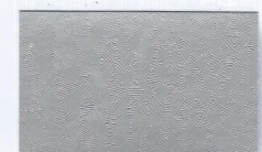
ACRYLIC COATED GALVALUME ®