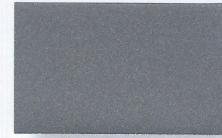
*PRE-WEATHERED GALVALUME ®