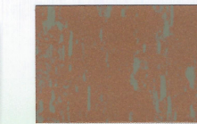
*COPPER-TEN ™ RAW